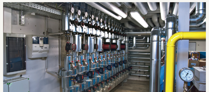
TYPICAL APPLICATION - BOILER ROOM